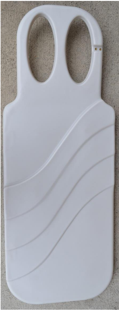
Gate Door- Part A