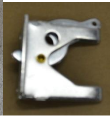
Gate Latch- Part B