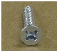
3/4" Screw- Part G