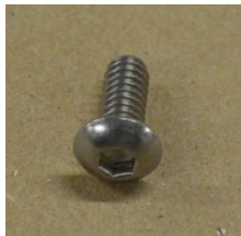
1/2" Bolt- Part F