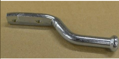
Gate Latch Bar- Part C