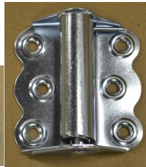
Gate Hinge- Part D